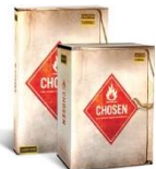
Chosen: Your Journey Toward Confirmation