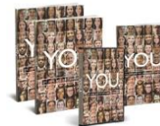
You: Life, Love & the Theology of the Body

Youth Nights: Wednesdays 7:00-9pm Olive Hall: In addition to the catechesis requirement, each student must attend at least 8 teen “Connect” nights. These take place August-June. Approximately 25 are offered each year. Choose the days that work best for your schedule. Students must sign in to get credit for attending. A schedule will be provided by the Director of Youth Ministry. (Teens attending Catholic HS attend five).